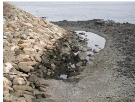
Erosion of the beach in front of this revetment created a depression at the base of the structure.