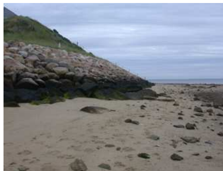
This rock revetment was installed on the lower part of a coastal bank, while salt-tolerant vegetation was planted to protect the upper bank.

Bulkheads - Also a type of hard structure constructed parallel to the shoreline, bulkheads are vertical walls designed to hold soil in place and prevent it from sliding or slumping into the water. Although they may also provide some protection from waves and tides, bulkheads are not typically appropriate to address coastal erosion. They are typically made of wood, steel or vinyl sheeting, granite