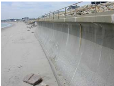
This concrete seawall was built to protect the homes and infrastructure behind it. This seawall has a curved face built into the top of the wall, which redirects some of the reflected water and waves away from the wall.

No shoreline stabilization option permanently stops all erosion or storm damage. The level of protection provided depends on the option chosen, project design, and site-specific conditions such as the exposure to storms. All options require maintenance, and many also require steps to address adverse impacts to the shoreline system, called mitigation. Some options, such as seawalls and other hard structures, are only allowed in very limited situations because of their impacts to the shoreline system. When evaluating alternatives, property owners must first determine which options are allowable under state, federal, and local regulations and then evaluate their expected level of protection, predicted lifespan, impacts, and costs of project design, installation, mitigation, and long-term maintenance.