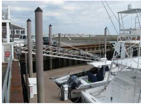
This steel bulkhead is built to hold the soil under this parking lot in place.

blocks, or concrete and are primarily used around developed harbors and marinas. Their vertical structure allows them to provide docking space for vessels in sheltered areas where wave action is relatively limited. The design considerations for bulkheads are similar to those recommended for seawalls (see below). A coastal engineer should be consulted for site-specific advice when bulkhead repairs are needed.