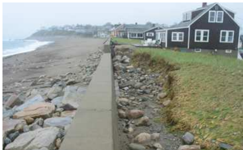
Water overtopping this seawall in a storm eroded the lawn and sediments behind it. Replacing the sediment and planting salt-tolerant vegetation may help to reduce erosion in future storms.

For sites without high banks, raising the height of the structure may be appropriate to provide protection from overtopping waves during large storm events. However, the increased wave reflection will likely result in greater beach erosion. Where appropriate, an alternative approach would be to add sediment to the beach and/or dune seaward of the structure to dissipate wave energy before it reaches the structure. Salt-tolerant vegetation with deep roots can also be used in conjunction with natural fiber blankets to address erosion behind seawalls and revetments. See the following StormSmart Properties fact sheets for more information: Artificial Dunes and Dune Nourishment , Planting Vegetation to Reduce Erosion and Storm Damage , and Beach Nourishment .