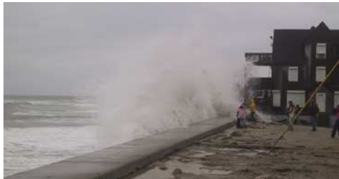
Waves are reflected by this vertical seawall, causing energy to be deflected straight down on the beach as well as straight up and over the wall, damaging the building behind it.

Vertical seawalls reflect water straight down and straight up. The wave energy that is reflected downward erodes the beach, while the wave energy that goes up into the air can overtop the structure and cause erosion behind the wall, potentially damaging the development or infrastructure being protected. If the seawall cannot be replaced with a revetment, a curved face can be added to the top of a vertical concrete seawall to help direct some of the reflected water and waves out and away from the wall. A coastal engineer will need to evaluate the applicability and potential effectiveness of this approach for each site. See the picture above of a seawall with a recurved face.