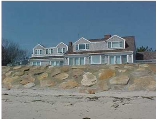
The surface of the rocks in this sloping revetment is relatively smooth and the spaces between the rocks have been filled with cement, further smoothing the structure. Smoother surfaces such as this reflect wave energy outward onto the beach and upward toward the house rather than dissipating the energy. The results are increased overtopping of the wall by waves, resulting in erosion and storm damage.

Rough surfaces dissipate more wave energy than smooth surfaces. Therefore, when individual rocks in revetments are replaced or repositioned, or when the structure is reconstructed, the seaward face should be rough instead of flat and smooth. The coastal engineer designing the project can specify the type of rock to use and how to build the structure to maximize dissipation of wave energy. In addition, no grout (e.g., cement) should be used in between the rocks in revetments because it smoothes the surface. Chinking (filling gaps with stones) should also only be done to the extent needed to structurally stabilize the revetment. Filling every void with small stones should be avoided because it reduces wave dissipation, and the small stones can become projectiles in a storm. Adequate void space between rocks also provides better habitat for marine species. Marine animals cannot hide or attach to flat, high energy surfaces. Rough surfaces with spaces in between rocks also reduce wave energy and provide spaces for encrusting organisms, like shellfish and anemones, and hiding spots for small fish. Through this approach, the area will be more diverse and biologically productivity, resulting in a more environmentally friendly seawall.