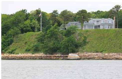
The bank above this revetment was stabilized with natural fiber blankets and native, salt-tolerant vegetation.

The higher the seawall or revetment, the more surface area there is to reflect wave energy. Therefore, projects that raise the height of an existing seawall or revetment must be considered carefully in light of the additional erosion that may be caused by wave energy reflected downward. The design height of seawalls and revetments is typically determined by balancing the desired level of protection to landward areas with construction costs and the need to minimize erosion of the fronting beach, which can compromise the structure in the future.