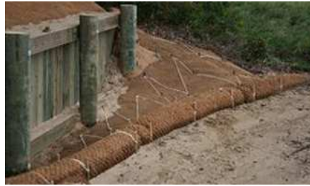
Coir rolls, natural fiber blankets, and fill were installed to prevent erosion at the end of this bulkhead.

Natural fiber blankets, coir rolls, artificial dunes, beach nourishment, and vegetation should also be considered for use at the end of the structure to both reduce end effects and provide the needed protection to the property. See the following StormSmart Properties fact sheets: Artificial Dunes and Dune Nourishment , Planting Vegetation to Reduce Erosion and Storm Damage , Bioengineering - Coir Rolls on Coastal Banks , Bioengineering - Natural Fiber Blankets on Coastal Banks , and Beach Nourishment .