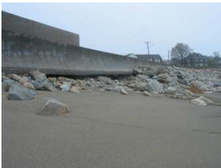
The beach in front of this concrete seawall eroded, undermining the structure.

To address seawall undermining, small rock revetments have often been installed in front of seawalls to protect the structure from collapse. As erosion continues, however, the small revetment may also be undermined—leading to designs that consider a larger revetment. A larger revetment will extend farther seaward, increasing the frequency and intensity of interactions between the structure and tides, waves, and currents and further worsening beach erosion. The result can be a succession of larger structures, increased wave reflection and erosion, and loss of beach, with the beach being permanently replaced by the hard structures. Erosion-control options that add sediments in front of the structure, like beach nourishment and cobble berms, can be used instead to effectively protect upland development and infrastructure, reducing impacts to neighboring properties, and maintaining beach resources and habitat. In addition, adding a revetment does not effectively stop waves and water from overtopping the seawall during storms. In many cases, overtopping and storm damage are more effectively reduced by adding sediment seaward of the wall to dissipate wave energy before it reaches the structure. This practice is referred to as beach nourishment (see StormSmart Properties Fact Sheet 8: Beach Nourishment for additional information).