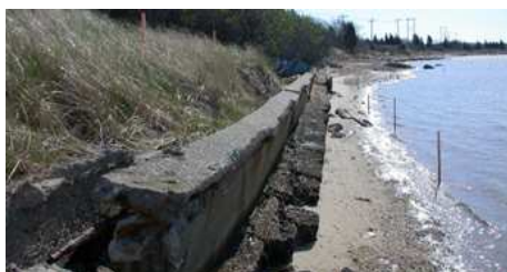
The vertical seawall at this site has been undermined and is failing. In this case, there is room on the site to replace the vertical wall with a sloping rock revetment that does not extend farther seaward onto the beach.