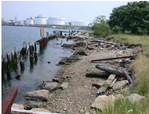
This bulkhead has deteriorated and erosion has occurred landward of it. When reconstructed, the bulkhead should be replaced with a sloping rock revetment to dissipate energy more effectively and reduce wave reflection. In addition, the toe of the revetment should be constructed at the base of the eroding bank to minimize regular interaction with waves and tides. This improved placement will reduce impacts to the beach and extend the life of the structure.

To minimize interaction with waves and tides and therefore reduce erosion to the fronting beach and adjacent areas, seawalls and revetments should be located as far landward as possible. When repairing or replacing an existing seawall or revetment, therefore, the structure should not be extended farther seaward. In addition, if erosion is occurring behind an existing structure, to minimize impacts, the structure should be pulled back to the base of the landward landform to prevent continued erosion from undermining the structure. Leaving the structure in place and using fill to reclaim land will likely continue the cycle of erosion. Seawalls and revetments should also conform to the natural shape of the shoreline without any segments extending seaward from the main structure, which would focus wave energy on the parts of the structure closer to the sea. This focused wave energy exacerbates erosion of the beach and reduces the longevity of the structure. In addition, the structure should not extend farther seaward than those on adjacent properties and every effort should be made to align the ends of the structure with adjacent structures.