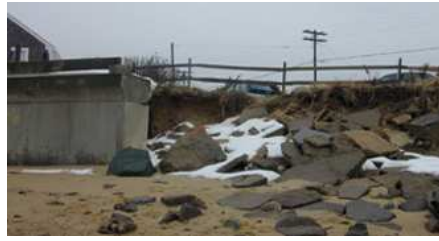
The end effects of this concrete seawall are causing erosion of the bank and damage to the parking area on a neighboring property.

During repair and reconstruction, it may be necessary to consider changes to reduce “end effects”—the increased erosion and storm damage to adjacent properties caused by the seawall or revetment. Unless the structure connects to an existing structure on an adjacent property, it should be shortened so that it ends approximately 15 to 20 feet from the property line (where feasible and where adequately protective of the building on the site). The ends of the structure should also be tapered so that both its elevation and slope are gradually reduced to further minimize end effects.