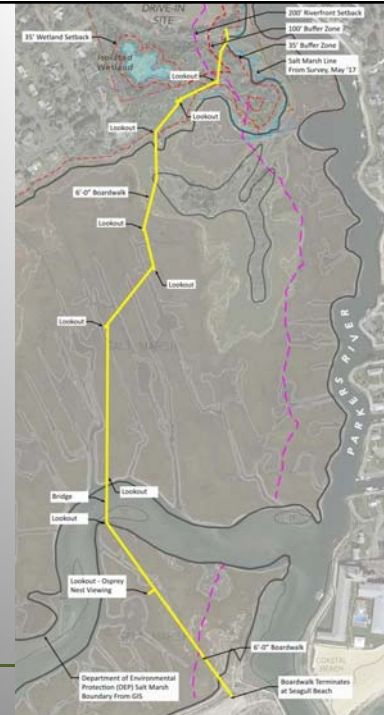
Yarmouth Riverfront Park & Boardwalk