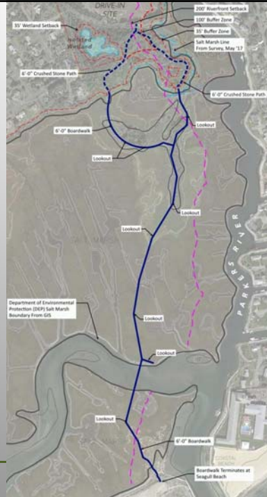
Yarmouth Riverfront Park & Boardwalk